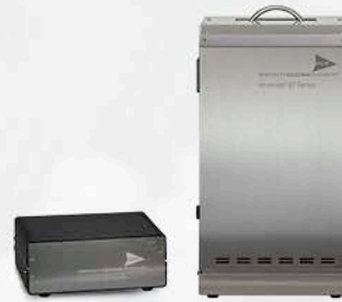
Ionograph BT SP and control module