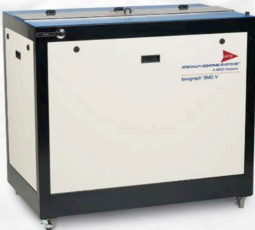
Ionograph SMD V

increasing cleaning efficiency, a heated system also ensures temperature consistency of the test solution, whereas solution temperature in an unheated system can vary due to circulation pump friction created during the testing process. The Ionograph SMD V is CE, ETL and UKCA-certified and is available with a convenient, onboard all-in-one computer, providing efficient control and monitoring of the test system using Windows®-based PowerView™ software. The system features easy-access door panels for the routine maintenance of consumable components (e.g., DI columns and pump filter). An optional stainless steel parts basket provides a convenient process for placing parts into the test cell and retrieving them following testing.