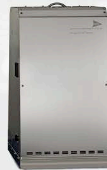
Ionograph BT LP