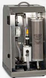
Internal view of Ionograph BT SP

Available for all three Ionograph BT models, optional stainless steel parts baskets provide a secure process for placing parts into the test cell and retrieving them following testing.