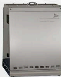
Ionograph BT MP