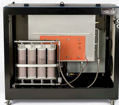
Internal view of Ionograph SMD V